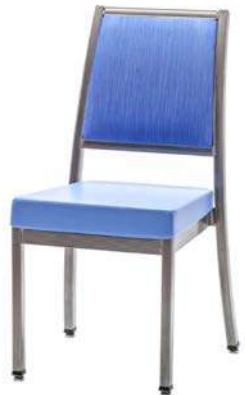
GTW-103 Shown with Optional Murano Tube Frame