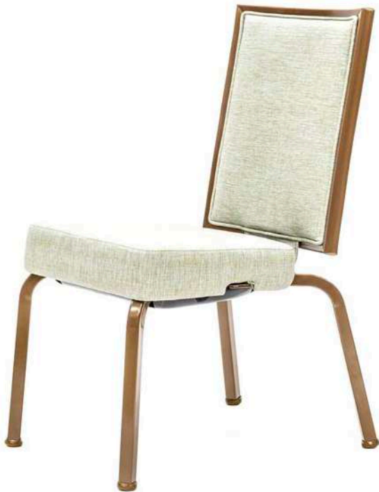
VIS-100 Shown with Optional Retractable Ganging Brackets (GB2)