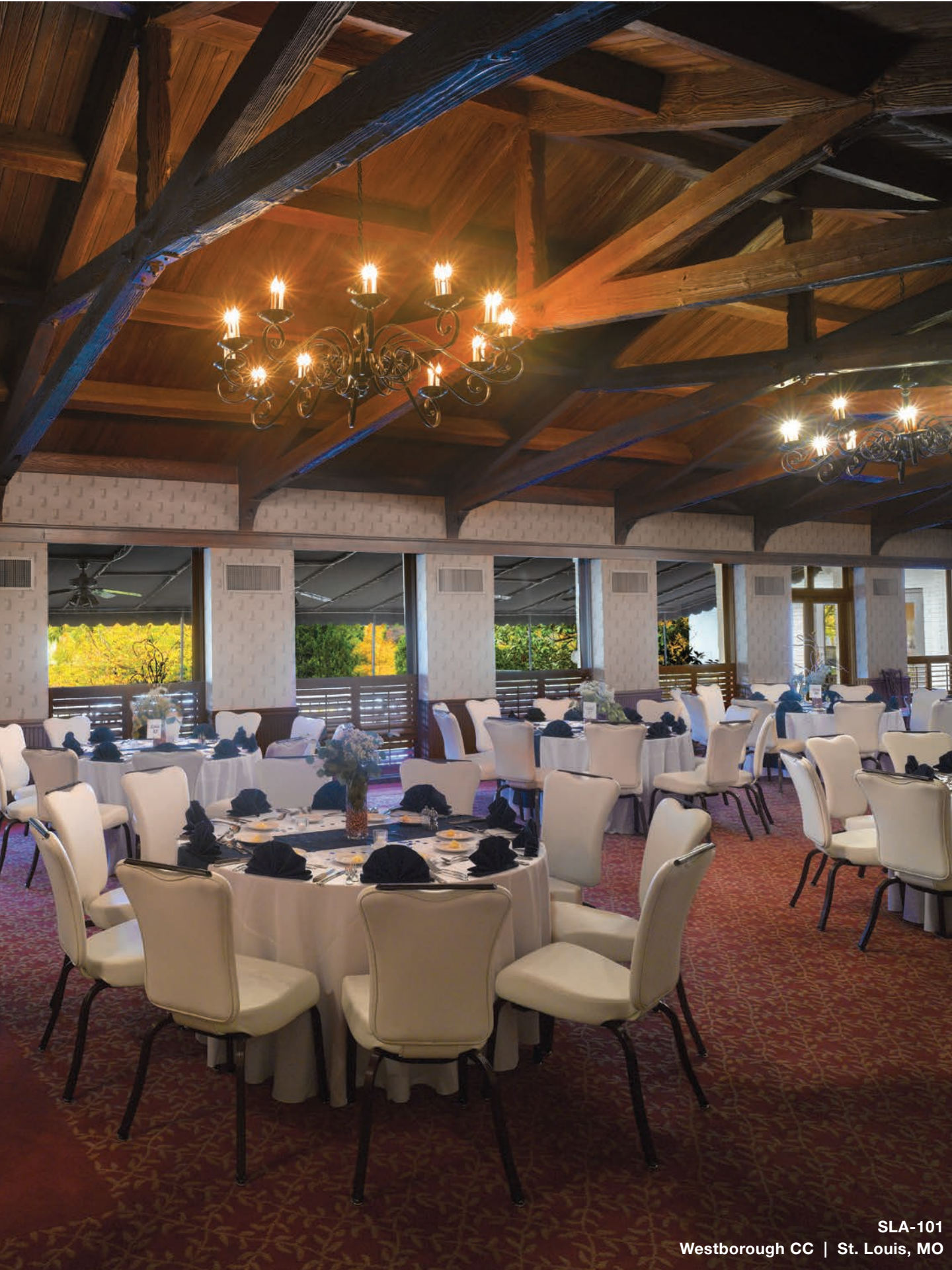
SLA-101 Westborough CC | St. Louis, MO