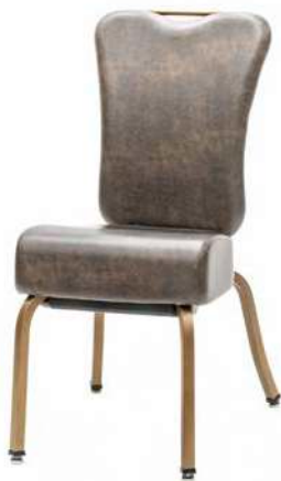
SLA-101-S10 Contoured Backrest to Maximize Stacking Stacks 10