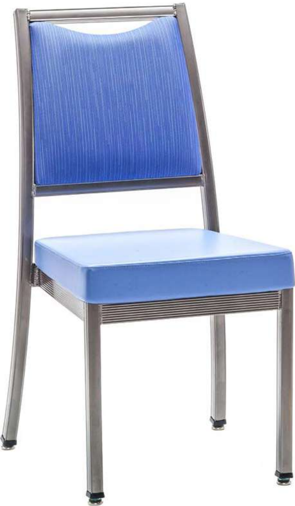
GTW-103 Shown with Optional Integrated Hand Hold and Optional Murano Tube Frame