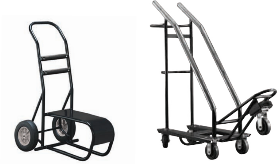
STANDARD HAND TRUCKS Gasser Standard HT series Stack Chair Hand Trucks are constructed with a welded assembly of heavy gauge steel tube protected with a durable Powder Coat finish.

Hand Trucks are built to meet the size requirement of each stack chair model series. It is important to indicate the specific Gasser stack chair being used when ordering hand trucks.