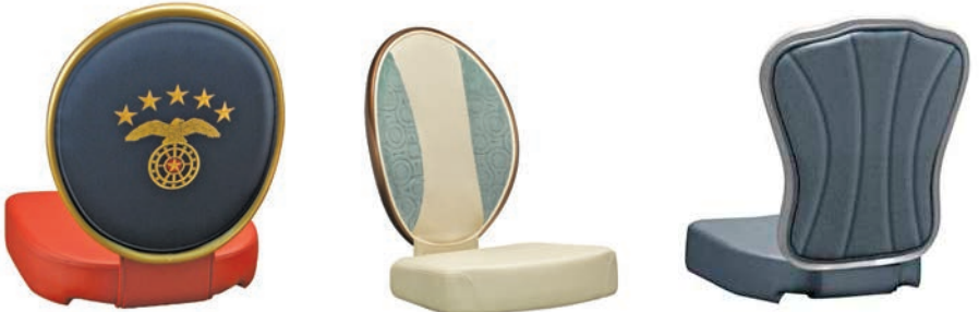
CUSTOM EMBROIDERY Your logo embroidered to personalize your chair