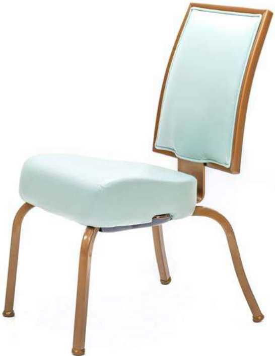
VIS-201 Shown with Optional Retractable Ganging Brackets (GB2)