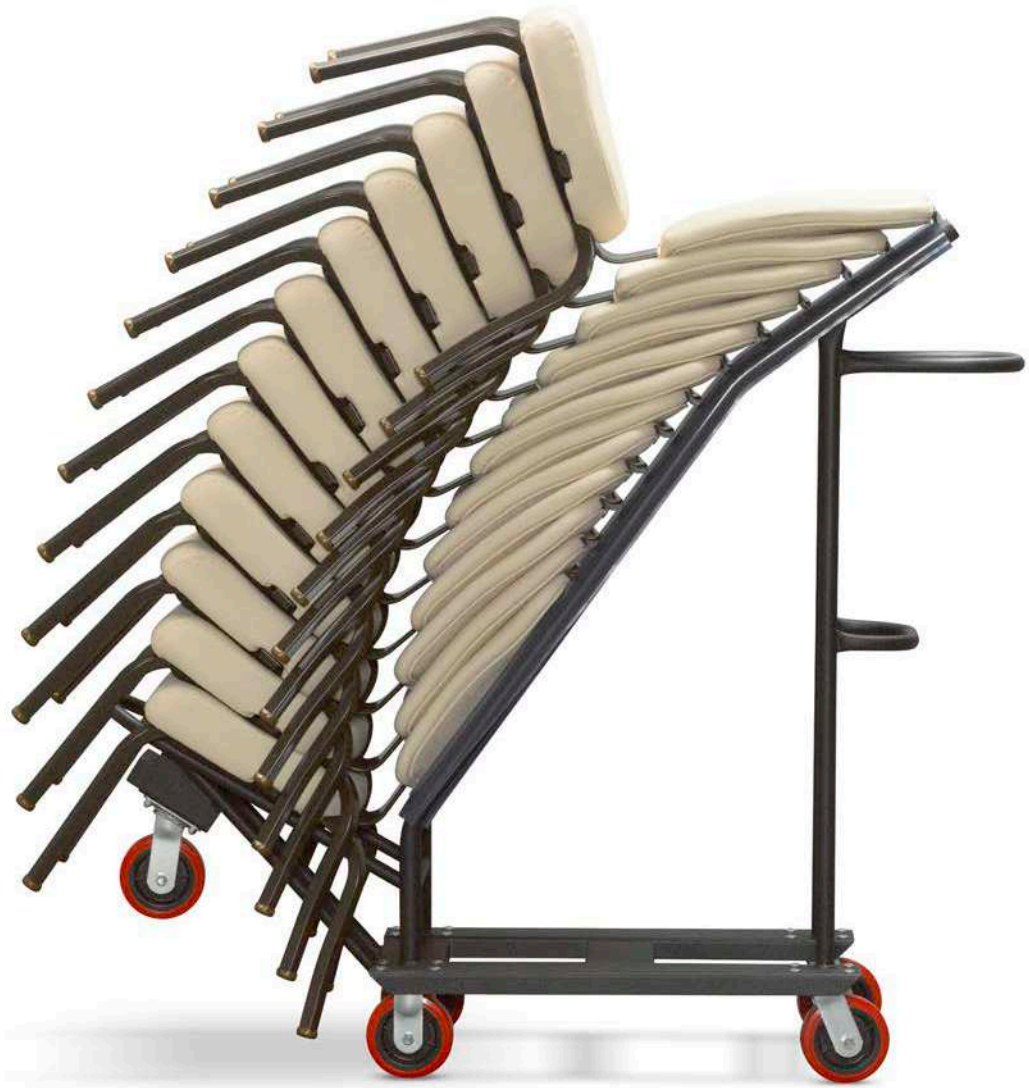
HEAVY DUTY HAND TRUCKS This HD Hand Truck is designed to tilt back on the rear set of wheels in order to safely transport a stack of chairs with less effort and better efficiency. It is ideal for use when many chairs are being frequently moved.