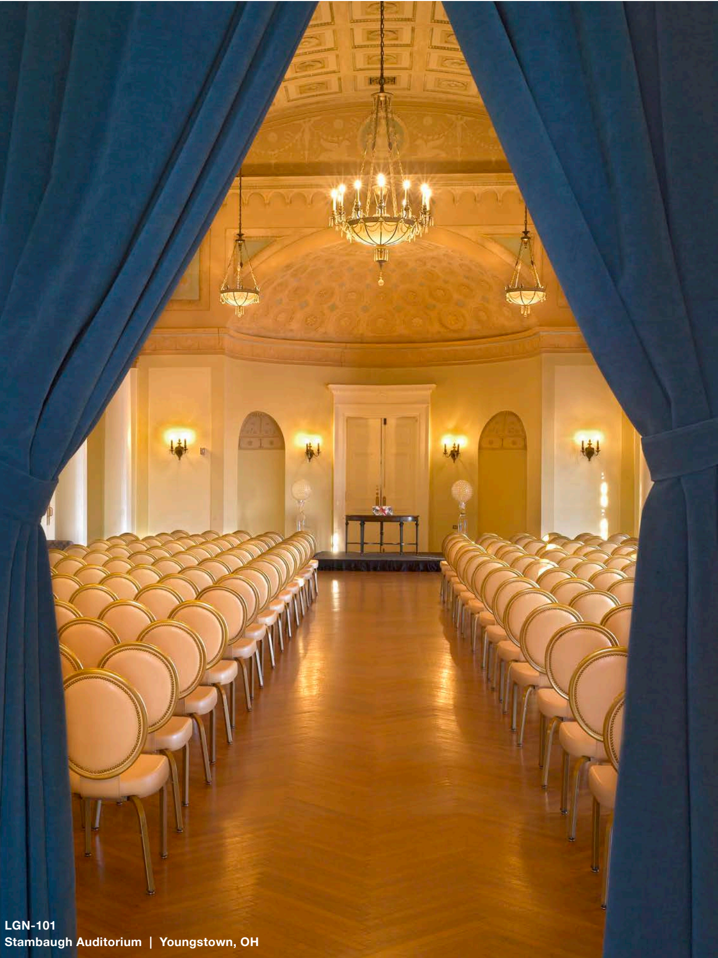
LGN-101 Stambaugh Auditorium | Youngstown, OH