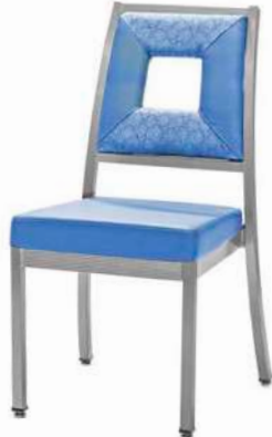
GTW-104 Shown with Optional Accent Upholstery