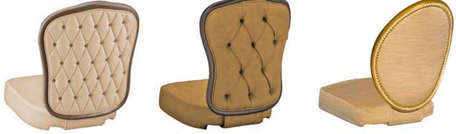
SEWN BUTTON TUFTING (BTO) Sewn diamond-shapes in padded inside or outside upholstery of backrest with decorative nails