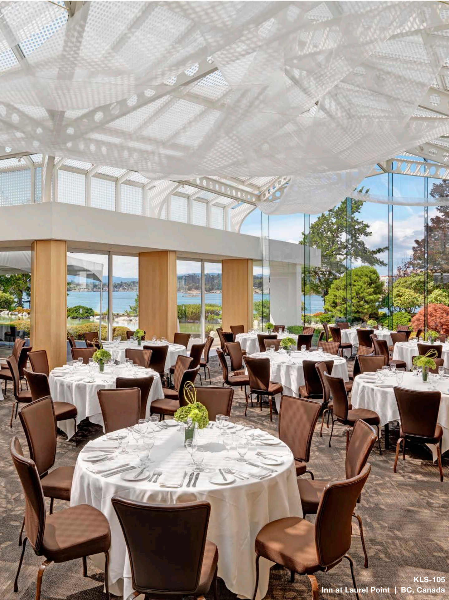
KLS-105 Inn at Laurel Point | BC, Canada