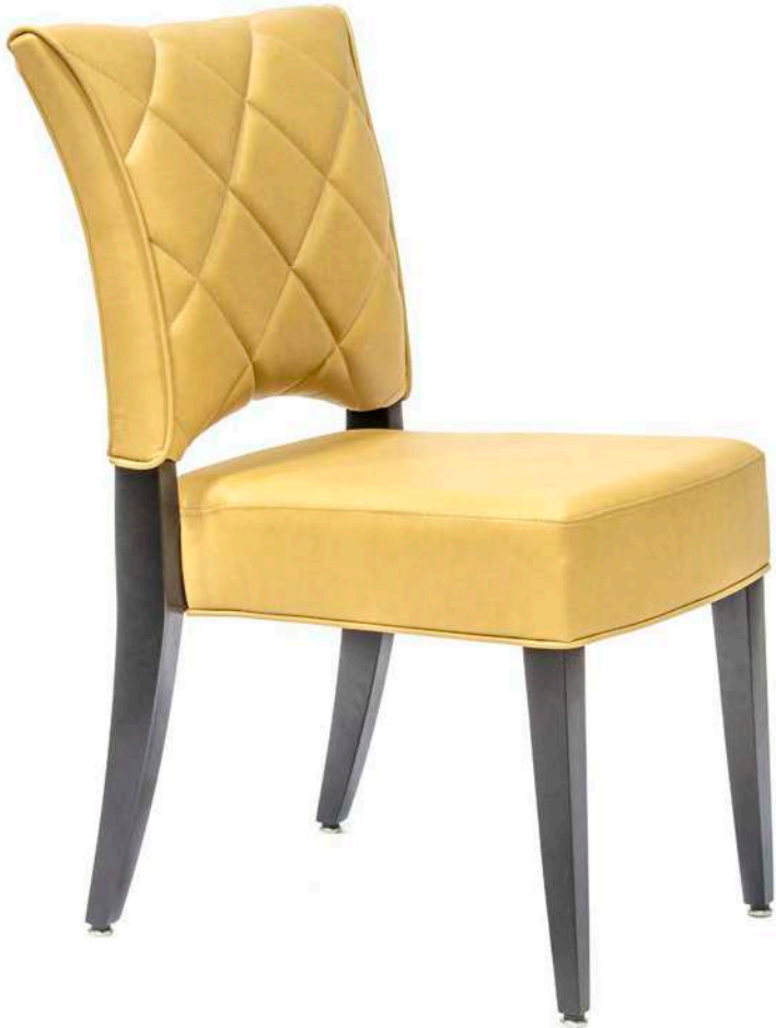
GLD-100 Shown with Optional Diamond Channel Sewing