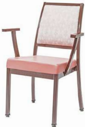
GTW-103-A Inter-Stackable with Side Chairs Shown with Wood Arm Caps