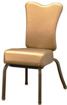
SLA-101 Shown without Hand Grip