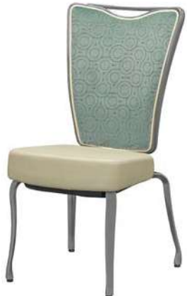
KLS-105 Shown with optional Integrated Handle* *Not available on all models