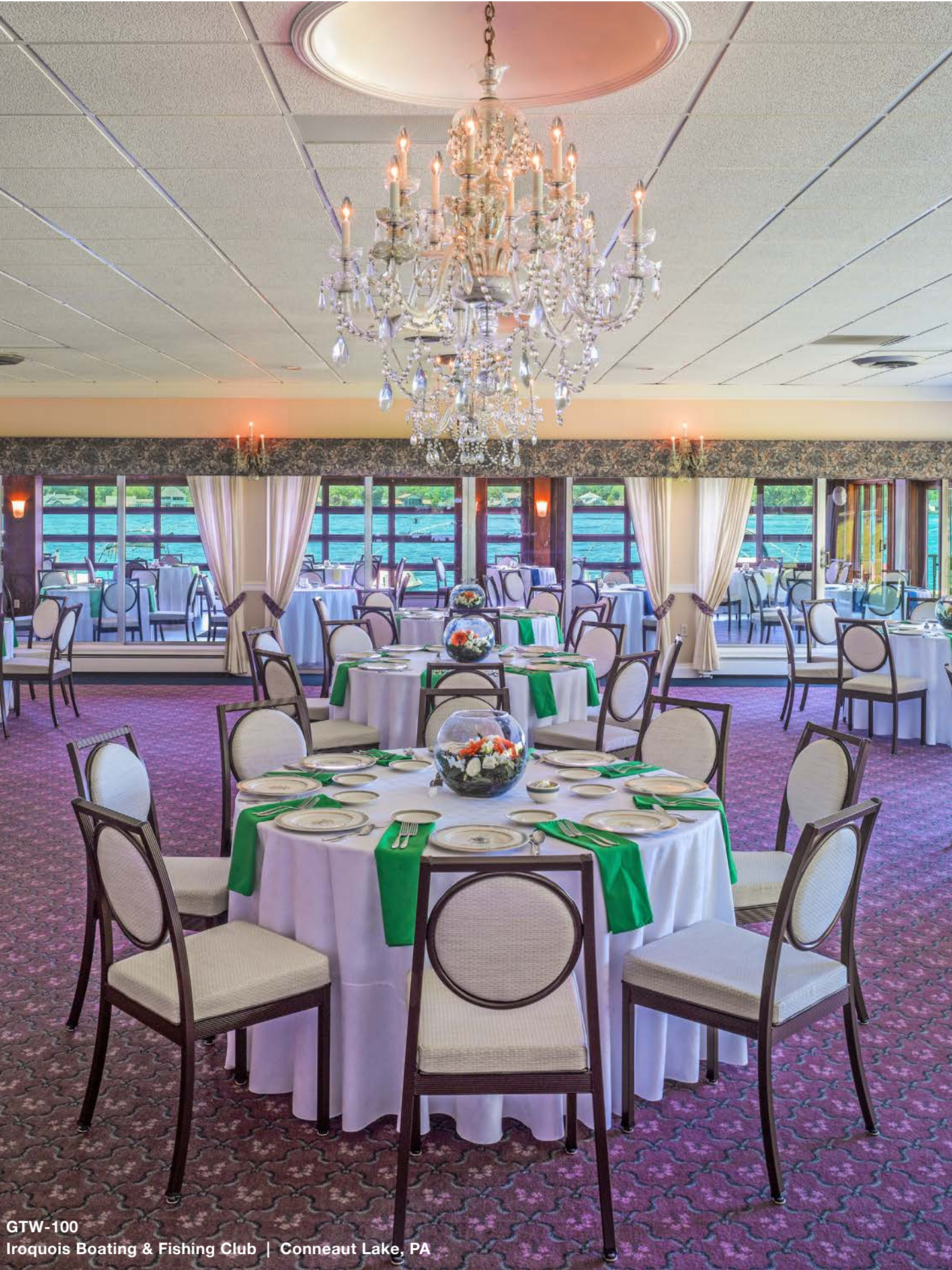
GTW-100 Iroquois Boating & Fishing Club | Conneaut Lake, PA