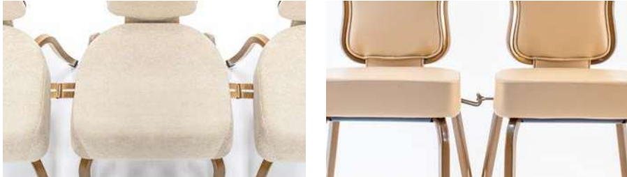
RETRACTABLE GANGING BRACKET (GB-2) Brackets slide under the seat when not required