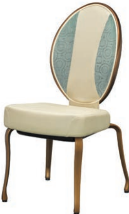
KLS-102 Shown with optional Accent Upholstery