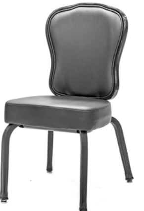
LGN-200 Seat is One Inch Wider with a Scalloped Front Stacks 8