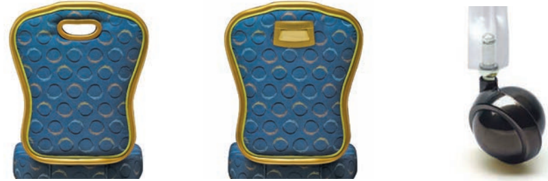
HAND HOLD 3 (HH-3) Hole through backrest