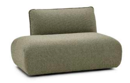
End Modul left