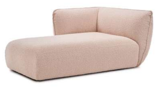
Recamiere Armrest left