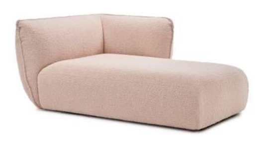
Recamiere Armrest right