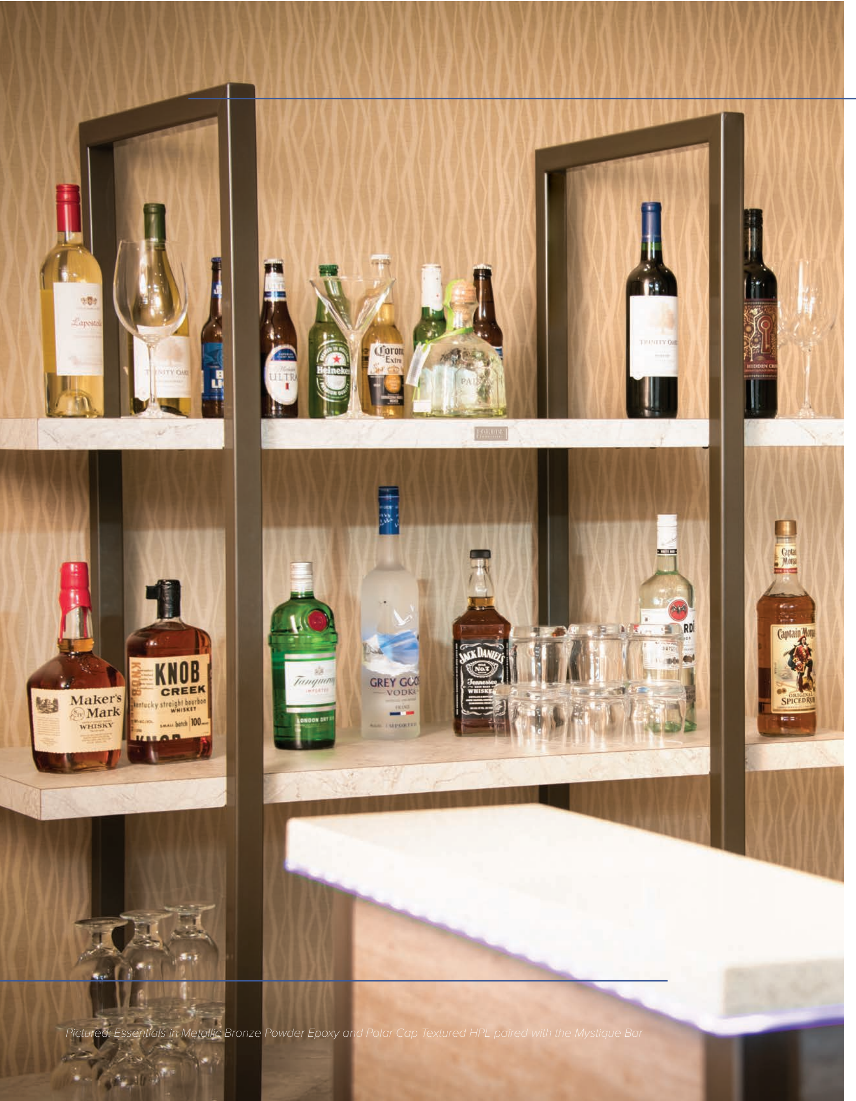
Pictured: Essentials in Metallic Bronze Powder Epoxy and Polar Cap Textured HPL paired with the Mystique Bar