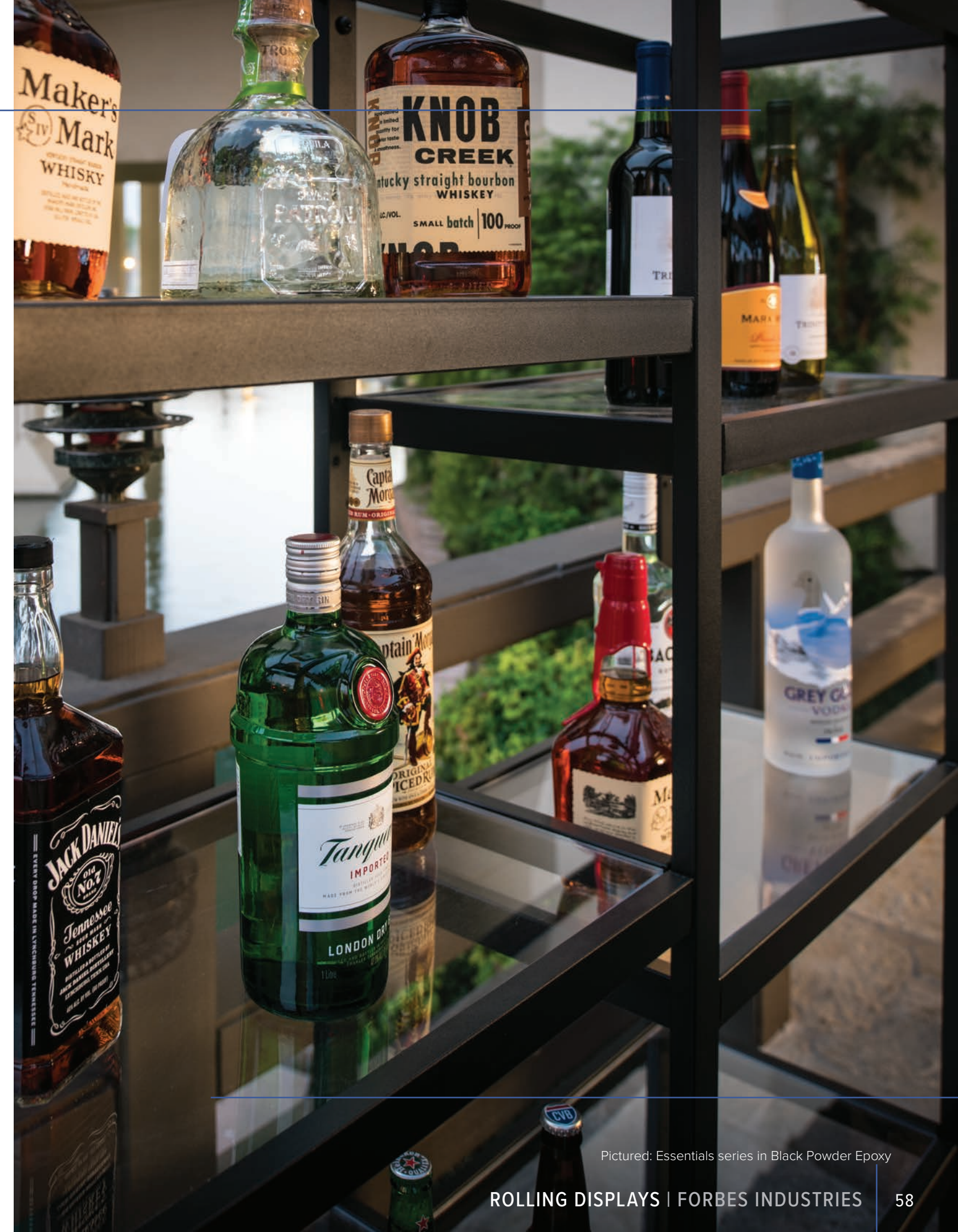
Pictured: Essentials series in Black Powder Epoxy