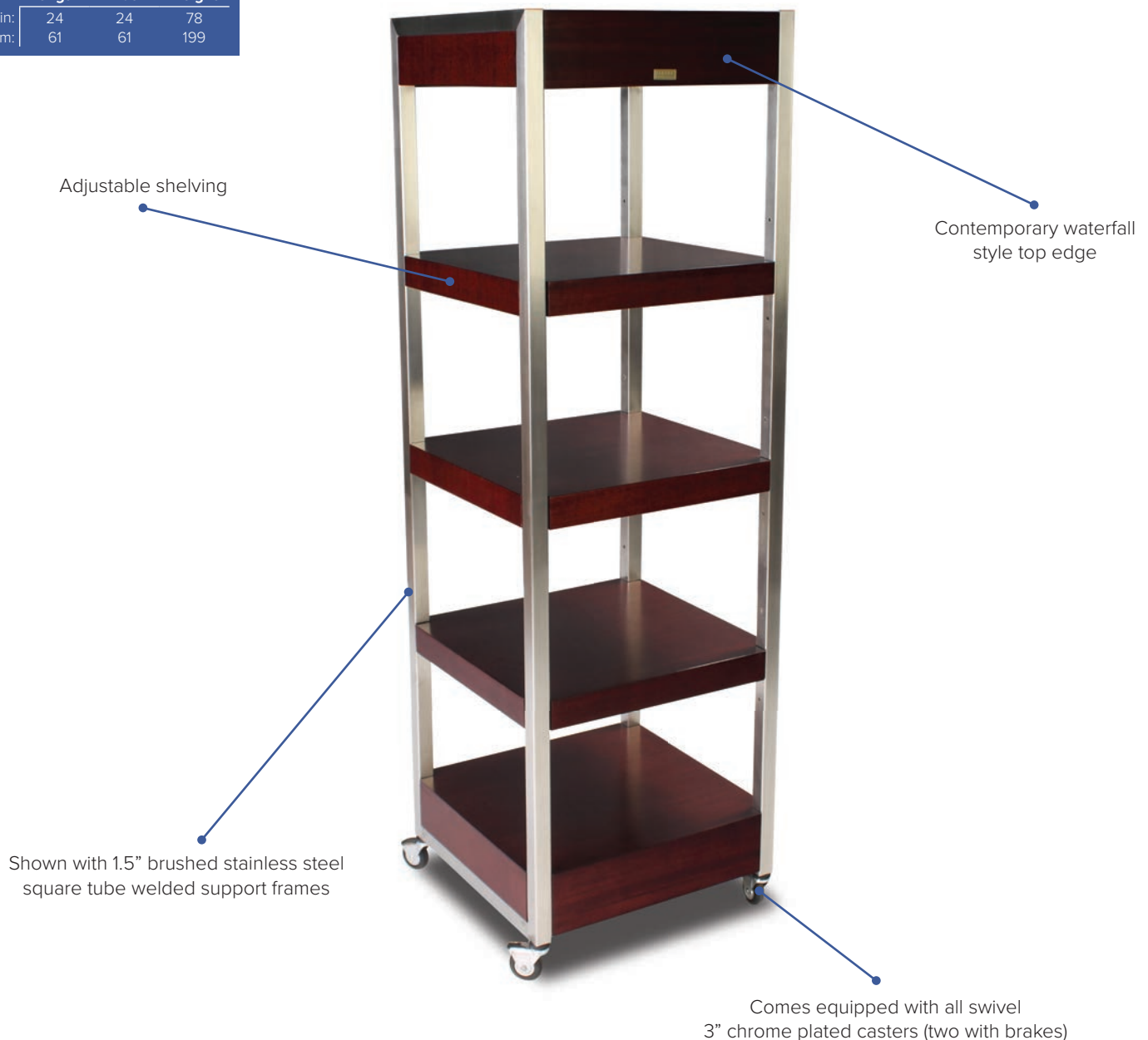
Pictured: Elite Series Satin Red Mahogany Wood Veneer