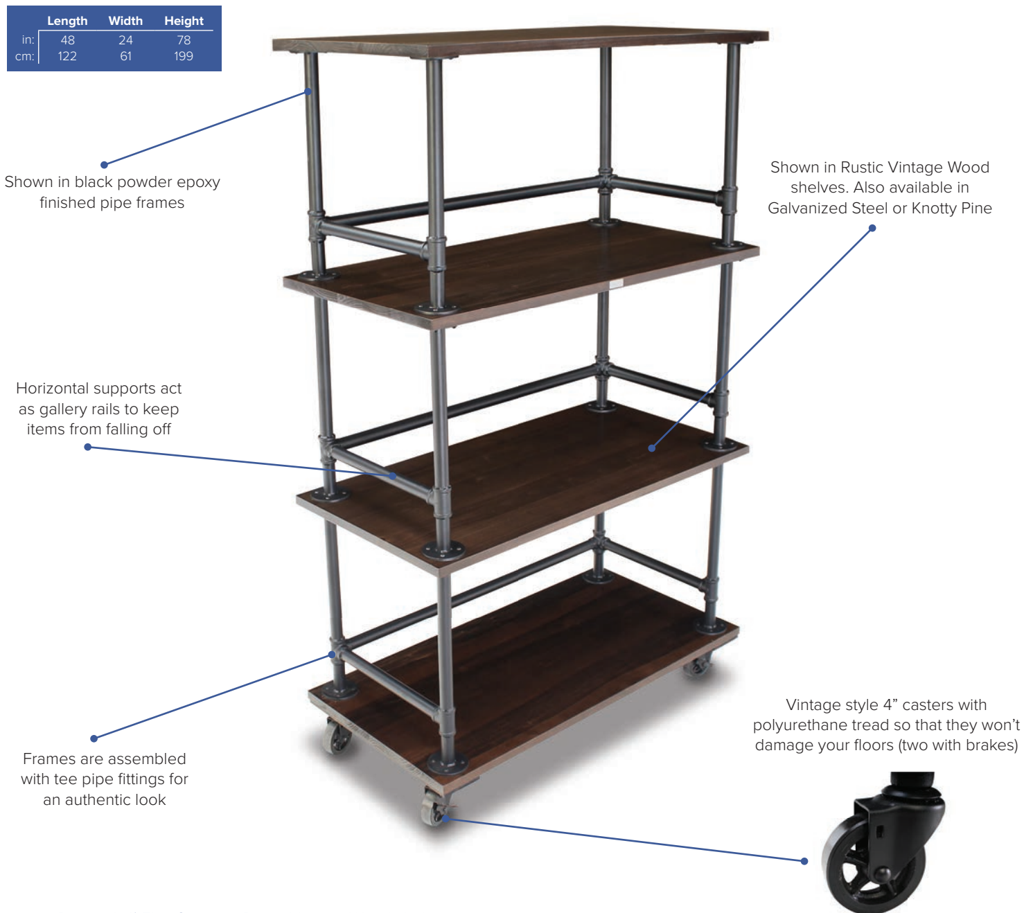
Pictured: 4' Elite Series in Rustic Vintage Wood shelves