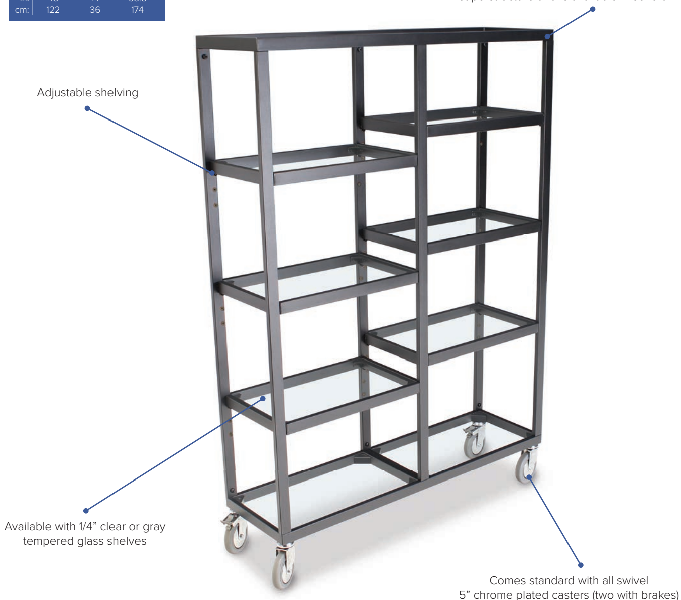
Pictured: Essentials in Black Powder Epoxy finish and Clear Tempered Glass shelves

The Classic is built with a 3/4" x 1 1/2" tube superstructure and is available in several finishes