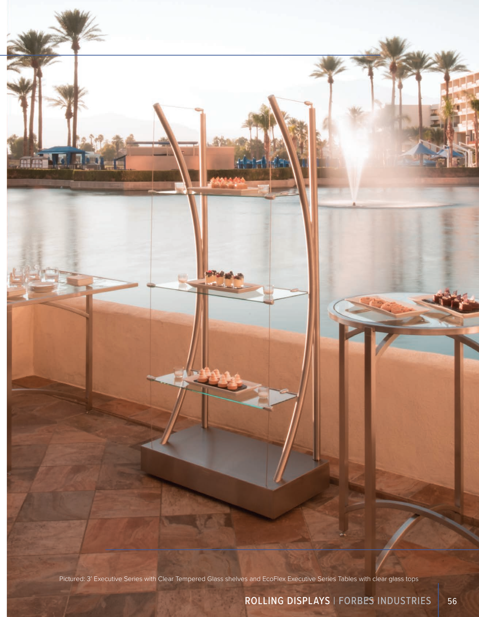
Pictured: 3' Executive Series with Clear Tempered Glass shelves and EcoFlex Executive Series Tables with clear glass tops