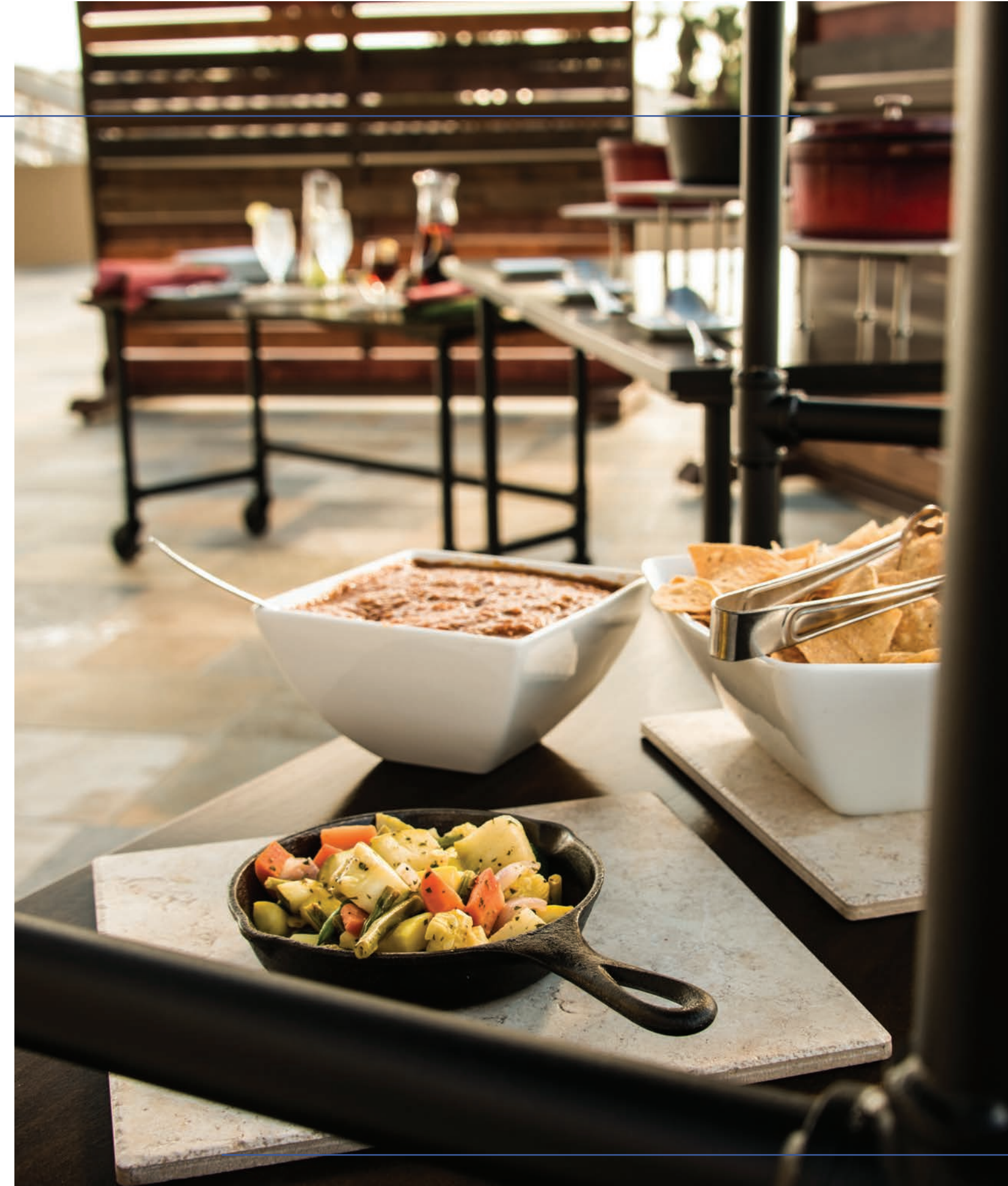
Pictured: 4' Rustica Rolling Display Elite Series in Rustic Vintage Wood shelves paired with the Rustica Nesting Tables