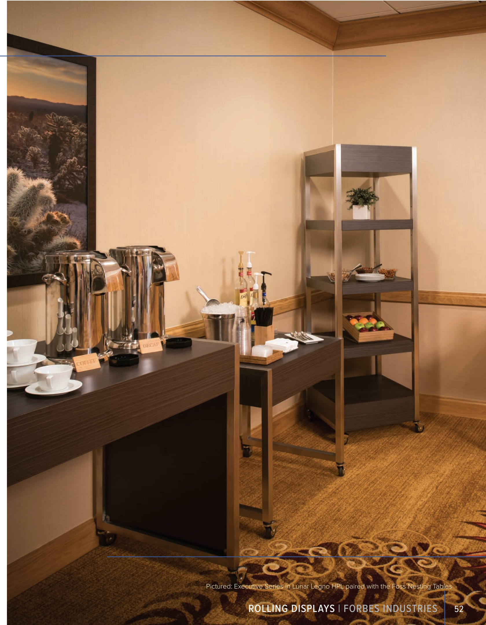
Pictured: Executive Series in Lunar Legno HPL paired with the Foss Nesting Tables