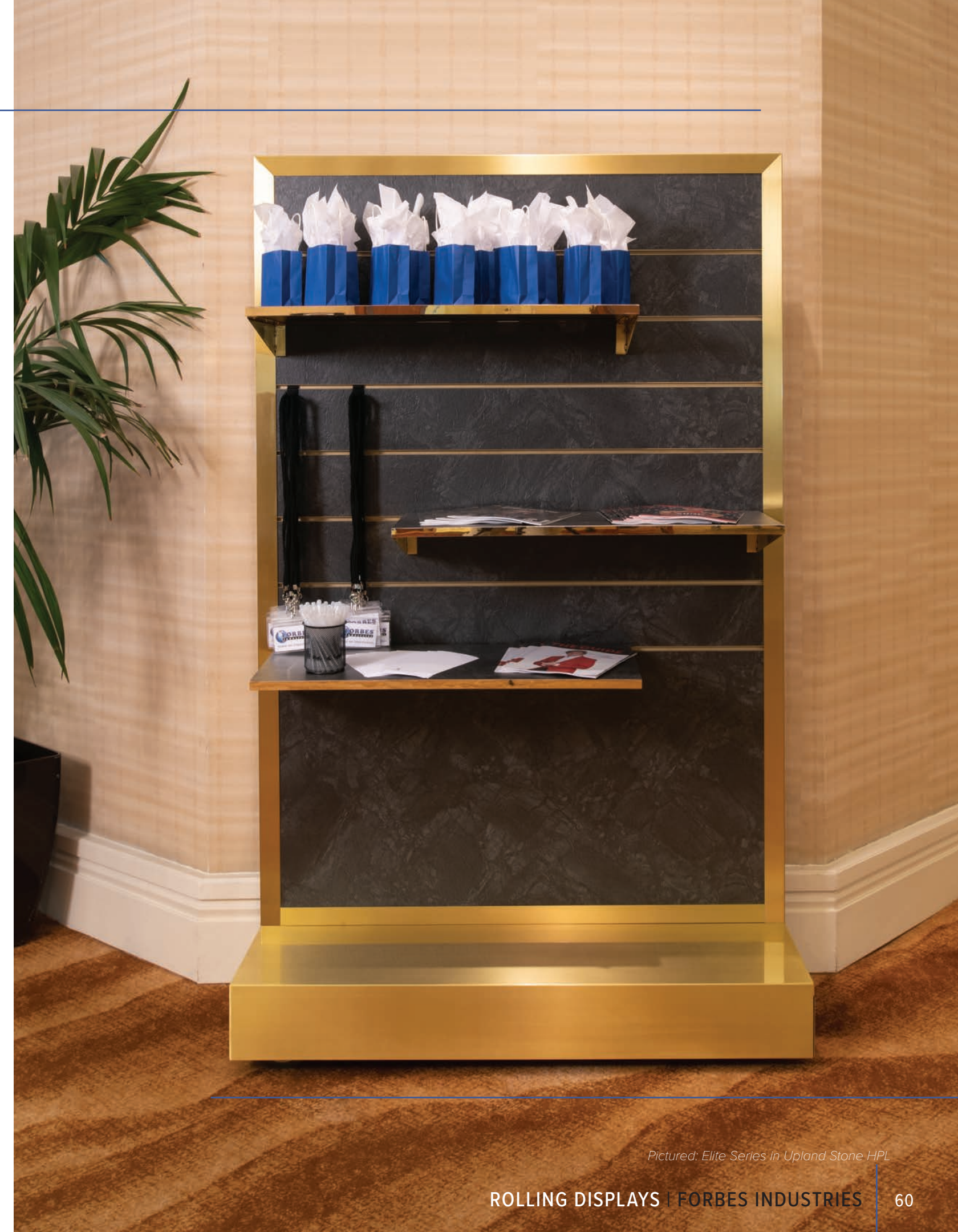
Pictured: Elite Series in Upland Stone HPL