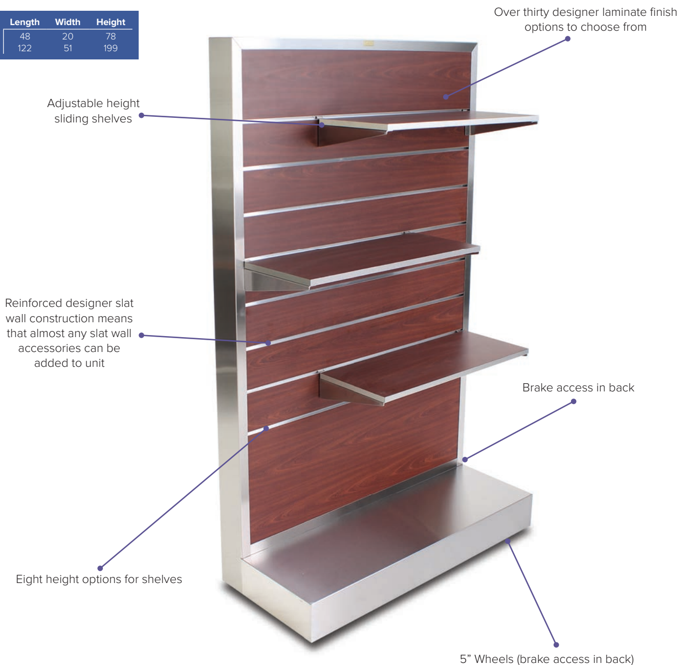
Pictured: Executive Series in Mahogany HPL