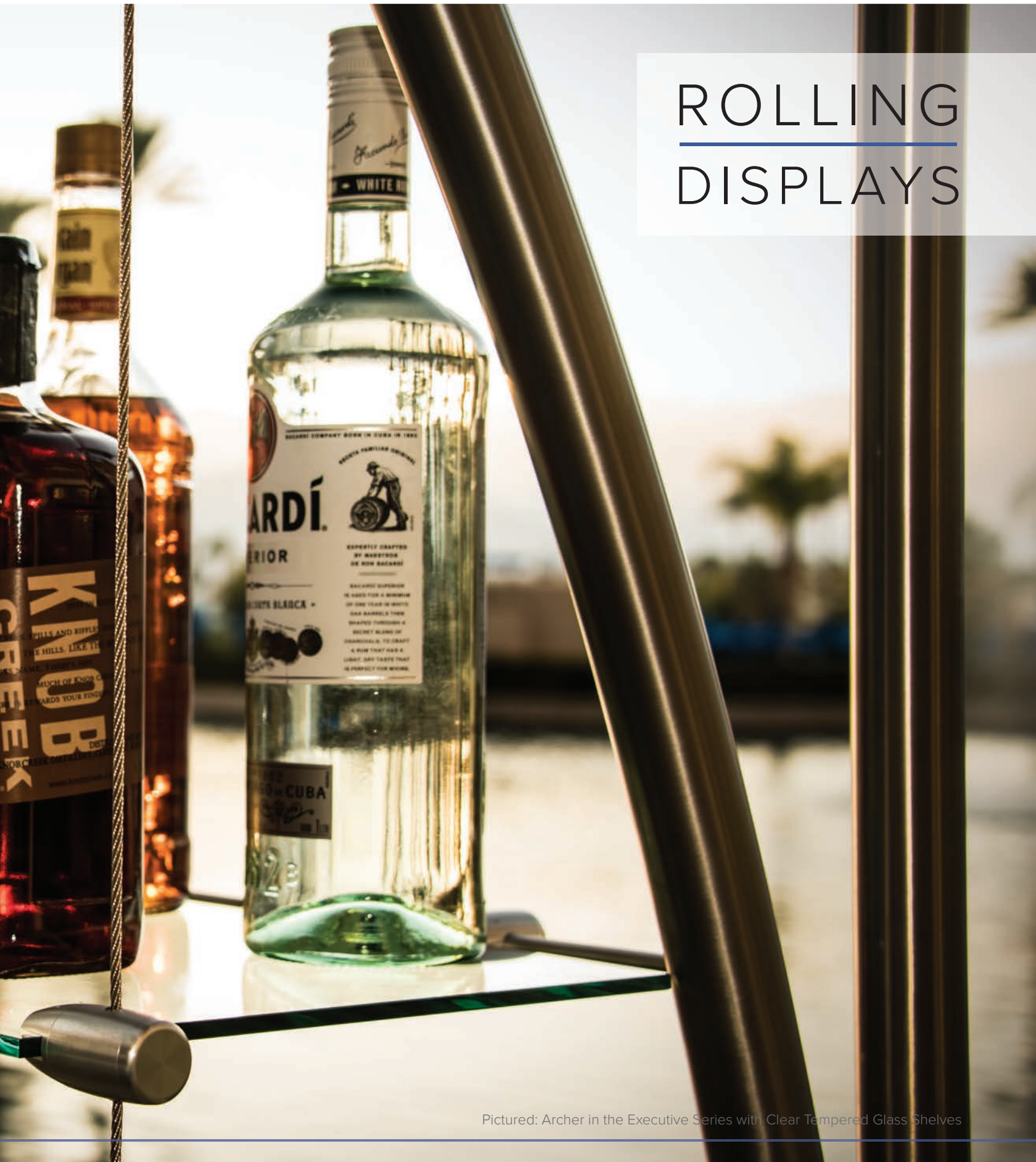
Pictured: Archer in the Executive Series with Clear Tempered Glass Shelves