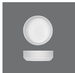
Schale rund , Fruit saucer round, Compotier rond, Compotera redonda, Coppetta rotonda