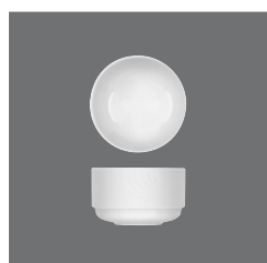
Bowl rund , Bowl round, Bol rond, Bowl redondo, Bowl rotonda