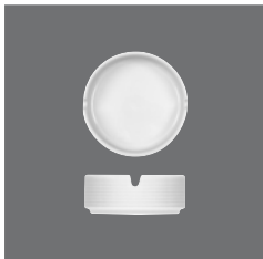
Ascher, Ashtray, Cendrier, Cenicero, Posacenere