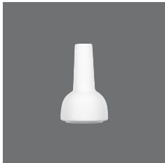
Tischvase, Flower vase, Vase à fleurs, Florero, Vaso per fiori