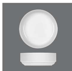
Salatiere rund , Salad dish round, Saladier rond, Ensaladera redonda, Insalatiera rotonda