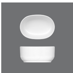
Zuckertütenbehälter, Sugar package holder, Sucrier spécial, Azucarero por bolsitas, Zuccheriera