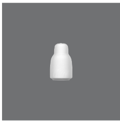
Salz-/Pfefferstreuer, Salt / Pepper shaker, Salière / Poivrière, Salero / Pimentero, Spargi sale / Spargi pepe