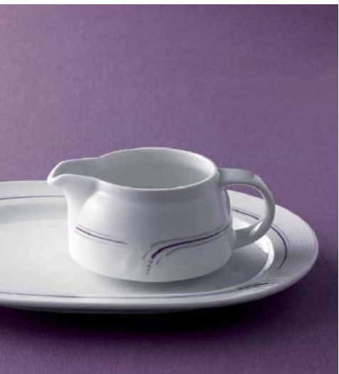
Décor Baccara (405750)