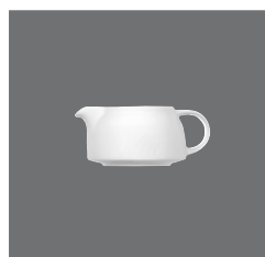
Sauciere , Sauce-boat, Saucière, Salsera, Salsiera