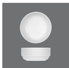
Suppenschale , Bowl, Bol, Bowl, Coppetta zuppa