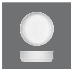
Eintopfschale , Stew bowl, Bol à plat unique, Bowl puchero, Coppetta minestrone