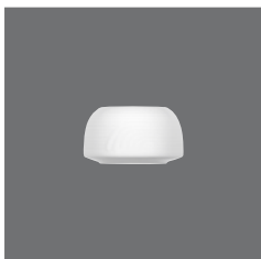
Leuchter Tülle 18 DIN 7409, Candleholder, Bougeoir, Candelabro, Portacandela